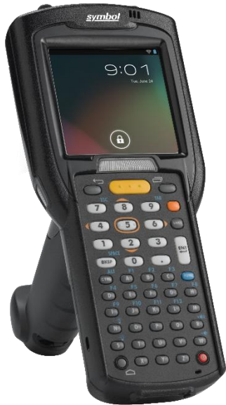
Android 4.1 Jelly Bean