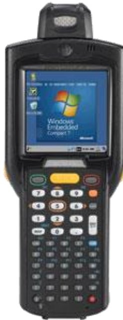
Microsoft Windows Embedded Compact 7.0